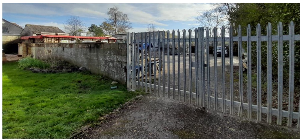
The applicant has confirmed that the crates the logs are stored in are 1.20m in height, a double stack is therefore 2.40m in height.

It is not considered that the proposed use will have significant visual impacts on the locality due to its siting and scale. Any approval can include a condition to restrict the height of crates stacked to two crates only to limit the height to 2.40m.