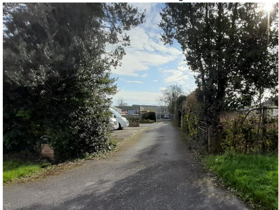
Photo below showing gates, boundary to application site, existing building and crates of logs on site.

Photo below taken from entrance to Newhaven looking south