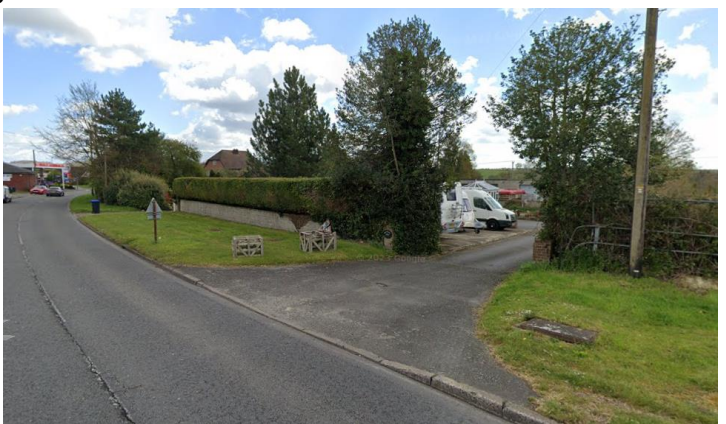
Photo below taken from north side of Larkhill Road looking direct down the driveway of Newhaven towards the application site.

Image below taken from Google maps showing entrance and boundary hedge to Newhaven along Larkhill Road.